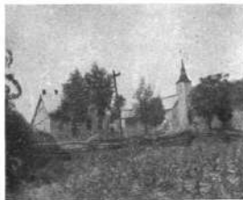
The Evangelical Lutheran Church, School and Parsonage, Augusta.